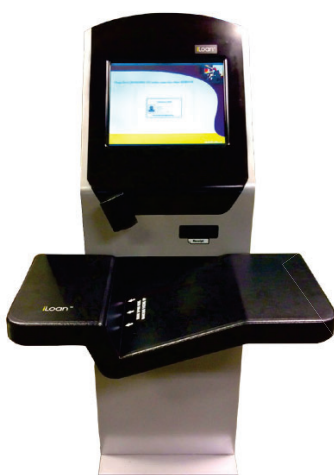
[ Self Loans ]