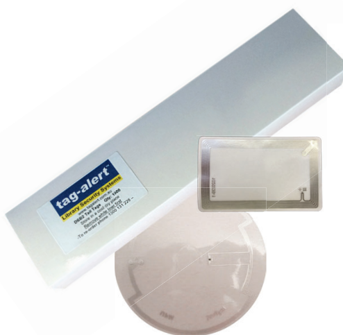
[ Security Tags & Labels ]