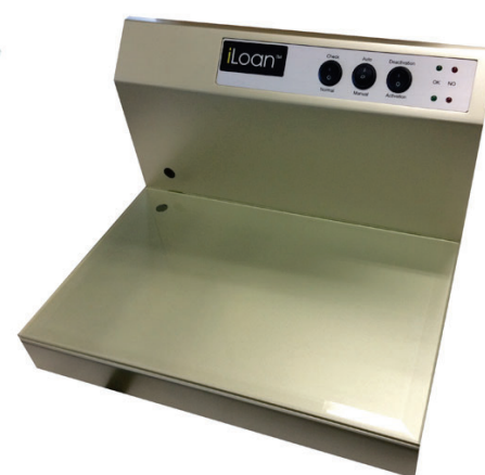
[ Circulation Equipment ]

[Speak to a Tag-Alert™ representative for obligation free advice when upgrading your library security system.]