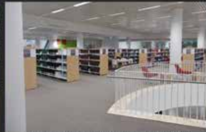
State Library NSW Reference Library