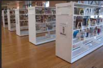
Ravenswood School for Girls