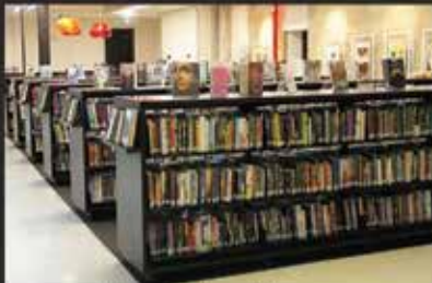
Sydney Customs House