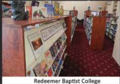
Redeemer Baptist College

50 years of Kingfisher™ library systems in Australia proves the test of time; discover how Kingfisher™ can create your library.