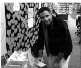
A would-be winner

Glenorchy Library & Online Access Centre celebrated Library Lovers Day 2009 for a week. Our focus was on the love of reading, and we also wanted to make maximum impact using minimum resources.