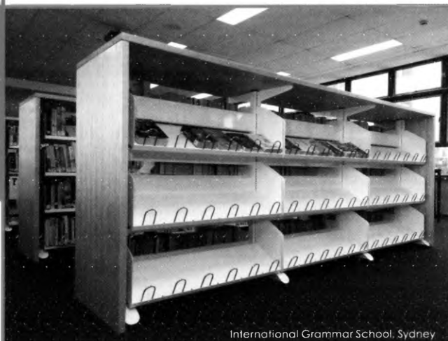
International Grammar School, Sydney

Offering Australian Libraries, institutions & Offices a superior level of quality, flexibility and durability with every installation.