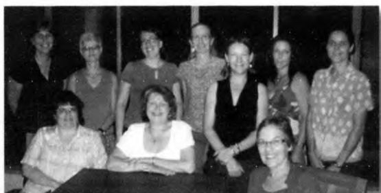
Participants of the Professional Development Day in FNQ