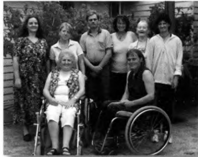
Participants in the community art project