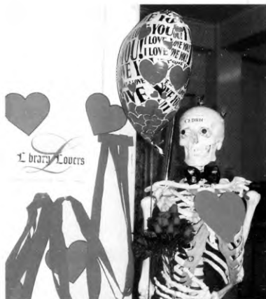
Cedric the skeleton

We have a resident skeleton called Cedric, whom we regularly dress up to fit a theme. Ced was done up in a bow tie, with a bunch of red roses, a big love heart plus a balloon.