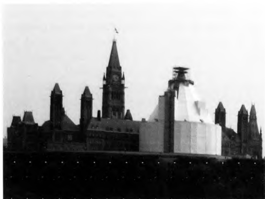
The Canadian Parliament, Ottawa. The Parliamentary library is currently undergoing restoration