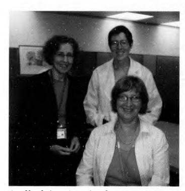
Staff of the virtual reference project, Libraries & Archives Canada

The tornado warning was lifted the day I flew into Calgary but I did arrive in time for the '1 in 200 years' flood. Yet the official state of emergency failed to dampen the spirit of the Canadian Libraries Association conference. The theme was 'Rediscover the library movement' and highlighted the need