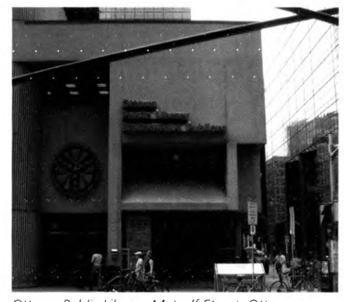
Ottawa Public Library, Metcalf Street, Ottawa