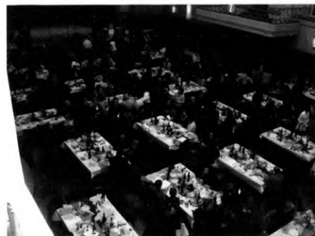
Some of the 400-plus participants who raised $30 000 at the trivia night