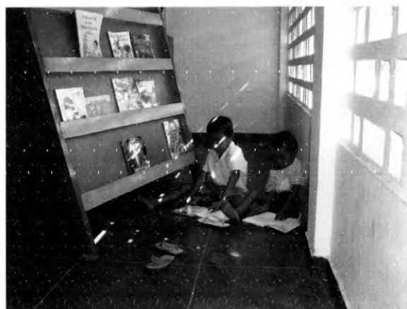
Children enjoy some quiet reading at the Atauro Island Library

All proceeds from the night were transferred to the Xanana Gusmao Reading Room in Dili, the first public library established in East Timor since independence. The Reading Room will co-ordinate the acquisition and distribution of new books. Libraries that will benefit from the trivia night include Xanana Gusmao Reading Room, Manatuto Public Library, Atauro Island Library, Baucau Public Library and the National University Library in Dili.