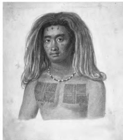
Augustus Earle (1793–1838) A native on the island of Tucopea c. 1827 watercolour on paper; 24.8 x 22.2cm Pictures Collection, Rex Nan Kivell Collection National Library of Australia

Travellers' Art also contains superb works by pre-eminent travel artists, dia-