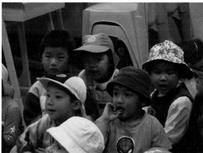
Children from Kameruka Cottage are enthralled by Mrs Wilkinson's Chooks at the St George College Library. As well as the story, children enjoyed chook-related craft activities