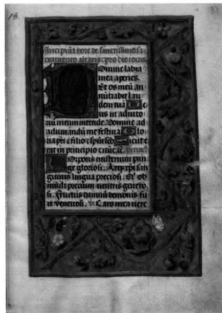
Stockholm-Kassel Book of Horns; bound manuscript; ink and pigment on vellum; 23.0 x 18.0cm Call no MS A227