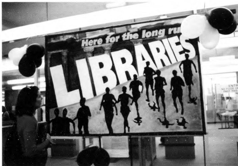
A canvas replica of one of the ALIA postcards produced to promote Australian Library Week was central to an exhibition showcasing university staff attitudes to the library

Australian Library Week at Southern Cross University Library