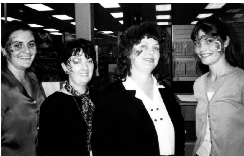
Marion Library staff get into the spirit of things and have their faces painted during ALW98