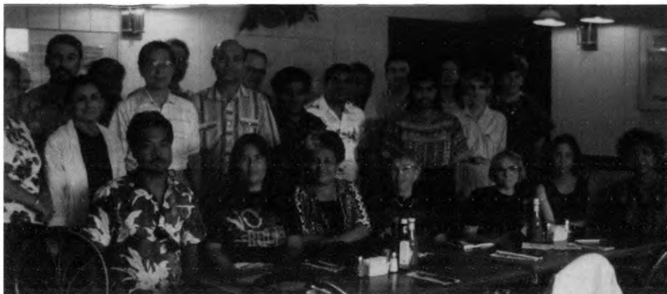
The beginning: a 1991 planning session planted the seeds for the establishment of PIALA.

To assure the chance for some regular interaction among members and regional librarians and archivists, PIALA holds an annual conference each year rotating the location among the various island groups so that as many local librarians as possible can attend. For many, attendance at PIALA is the only conference experience they have. Pre-conference training sessions bring in the only library training for the region outside of Guam. From 1-7 November, Pohnpei played host for PIALA 97. Offerings included a pre-conference work-