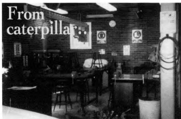
(left) before: Illawarra Institute of Technology, Goulburn — automotive workshop; (below) after: a modern, comfortable library now occupies the space