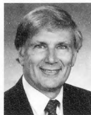
Senator Richard Alston Shadow minister for communications and the arts

Prior to the Federal Election on 2 March 1996, we asked a number of key people and prominent politicians to comment on our Lobby for libraries initiative. On the following pages find their considered response: