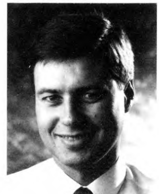
Michael Lee, Minister for communications and the arts, Minister for tourism

local access points to electronic information, including the Internet. In particular, the 1400 public library service points throughout Australia provide a major opportunity for linking communities to network services. The Commonwealth supports libraries and will continue to examine ways in which they can continue to be used to benefit local communities.