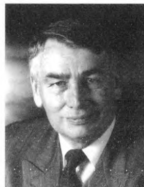
Brian Howe, Minister for housing and regional development

power. Without each citizen having the power of access there cannot be participation, there cannot be active citizenship, and there cannot be true democracy. As Benjamin Barber put it, rights can become a charade. We must not privatise access to knowledge. The first two staging posts in winning equity of access to information are our public schools and our public libraries. Resourcing them to provide on-line information and services is a vital link to an equitable and successful future for all the citizens of our country. I am only too pleased to Lobby for libraries.