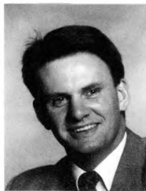
Mark Latham, Member for Werriwa

We have a rich and extensive archive which is of little use without the people to tell us what's in it and how to gain access to it. It is about time that libraries and the skills of librarians were recognised for the important role they play — in business, the public sector and the community. Libraries and the skills of information managers are more important than ever in the new information and media environment.