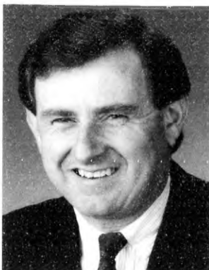
Simon Crean, Minister for employment, education and training

The institution of the library has always played an integral role in the lives of Australians of all ages. Libraries continue to be a vital educational tool for students as well as a highly valuable source of information and recreational reading material for the community. Advances in communications technology are providing libraries with the opportunity to offer a wide range of new services. The local library is often the most convenient and appropriate location for providing access to the vast array of public information that is readily available on-line but not always in a paper form. The coalition envisages that libraries will have a central role in enhancing on-line access to cultural and public sector information and have indicated that we will facilitate this role when in government.