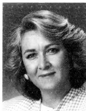
Cheryl Kernot, Leader of the Australian Democrats

enter the new age of information technology, libraries will play a key role in making the new information and communication technologies available to all Australians. In the education sector, for example, libraries are at the forefront in exploring the exciting opportunities offered by interactive communication networks to improve the delivery of educational services in Australia. The Commonwealth Government and the States and Territories have agreed on a major initiative, the establishment of a comprehensive education network, Education Network Australia (EdNA), which will deliver educational services and products nationally and aim to contain the costs of accessing interactive information networks. The EdNA initiative forms part of the overall national strategy announced by the Prime Minister on 6 April 1995 to ensure that Australia is well-placed to take advantage of the opportunities offered by the development of the so-called 'information superhighway'. Australia's libraries have a vital part to play in ensuring that this 'superhighway' is open to all Australians.