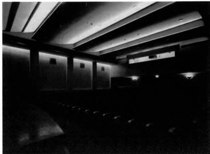
The State Library of Victoria's new 214-seat lecture theatre

Secondly, VICNET aims to publish information about Victoria from individuals and organisations on the Internet. It has published information on over 1000 community and public organisations, and gives access to a wide range of government information. Take a look at our world wide web site at http://www.vicnet.net.au . The huge amount of community, government and other Victorian information available on VICNET is in large part due to the voluntary assistance of individuals and community and other groups. VICNET plays a prominent role in Victorian Government initiatives in communications and multimedia — Victoria's on-line, searchable Hansard went live on 5 June, for example. VICNET has enabled the State Library of Victoria, for the first time in its history, to provide a service which will be equally accessible to all.