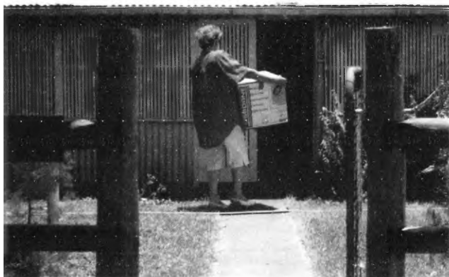
The new CD-ROM arrives at Pine Creek Community Library

CD-LINNET is produced by Aldis for the Northern Territory Library with twice yearly updates. For Pine Creek Community Library CD-LINNET means the resources of LINNET are now being made more available to local users. The impact of CD-ROM technology is enhanced in the setting of Pine Creek's combined museum and library's heritage corrugated iron building. ■