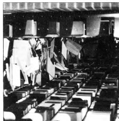
Thousands of books fall from the shelves: Auchmuty Library