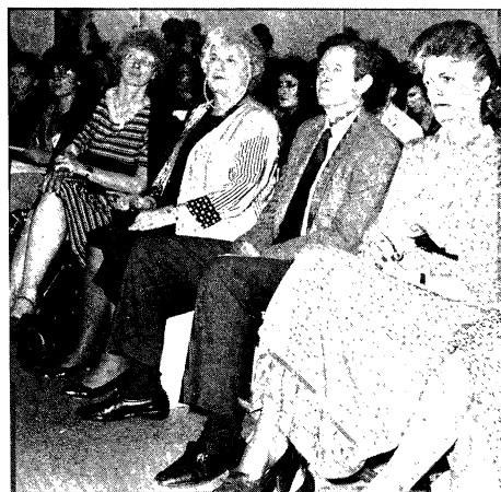
Delegates at the opening session of FIL.

Concurrent with the exhibition was a free cultural festival, featuring ballet folklorico groups, rock and reggae bands,