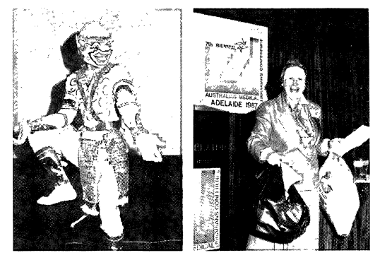
The monkey which brought good spirits to the Conference. Bags packed already for New Zealand in 1989.

have returned to their libraries rejuvenated and recharged, looking forward to the next conference in Auckland in November 1989.