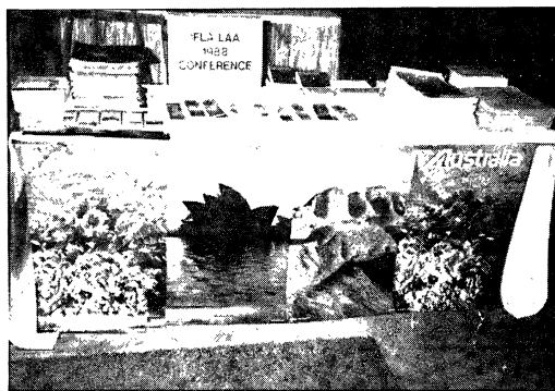
The LAA/IFLA stand at the ALA Conference in San Francisco.