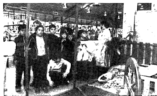
The theme for last year's Children's Book Week was 'Key into Books.' Erindale Centre Library, ACT, was decorated as an old Australian general store.

the award winning books. The Balwyn Library will have the Gardner Puppet Theatre presenting 'Gold or Gumnuts' and Ashburton will feature Red the Clown. Weekly storytimes will be based on the shortlisted titles.