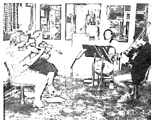
The string quartet.