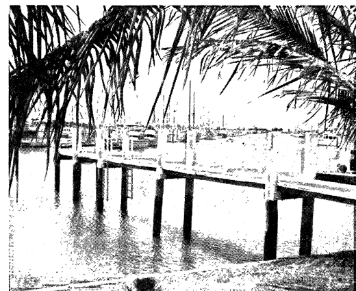
Photo: View from the Royal Brisbane Yacht Club, overlooking Moreton Bay.

To enable participants to make their First National Conference in July a working holiday, the TAFE National Section and TAFE Section Queensland Group have organised a variety of 'extra-curricular activities'. The highlight will be the Conference Dinner on Thursday 9 July at the Royal Brisbane Yacht Squadron at Manly, overlooking Moreton