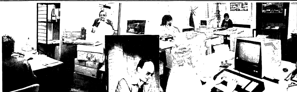
Your data arrives . . . and is keyed in . . . then taken for . . .

Table 1 shows that a generally good level of