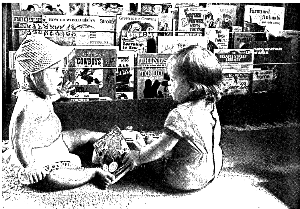
The ages of Cubby House patrons range from three months to 21 years.