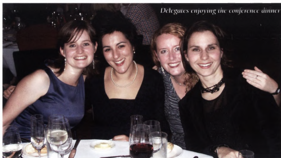
Delegates enjoying the conference dinner

Socially, a dinner was held on Thursday to recognise our event sponsors, which was attended by staff from head office, many