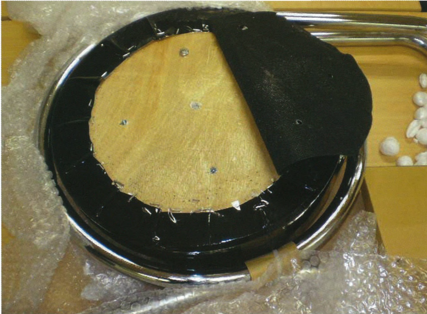
Above: Cocaine in bar stools.