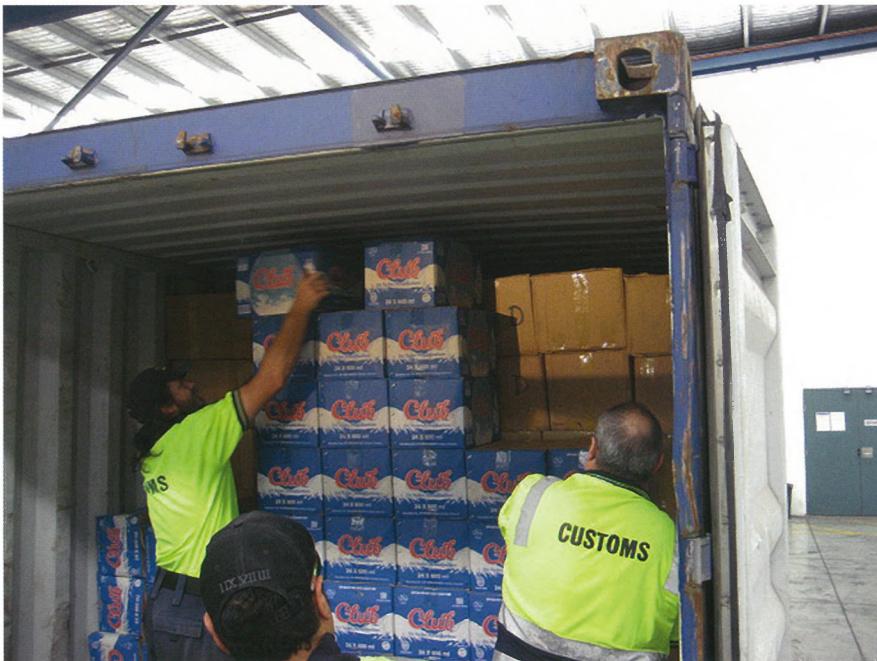
Above: Customs officers at Container Examination Facilities detected tobacco in containers.

Customs in Brisbane identified a steroid-distribution racket, with links to three States, after raiding five premises—testosterone, other illegal performance and image enhancing drugs and $150,000 cash, to be proceeds of crime, were allegedly found. The investigation began when Customs officers in Sydney detected parcels containing liquid testosterone and what is believed to be human growth hormone (HGH).