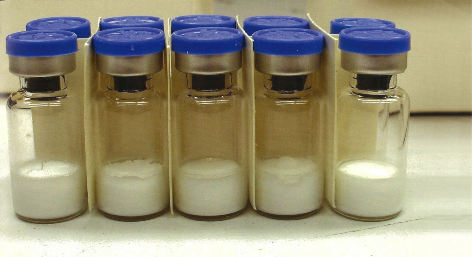
Above: A man was fined for illegally importing performance-enhancing drugs.

Customs officers at the Sydney Container Examination Facility identified a cigarette and tobacco smuggling racket, resulting in the arrests of nine men. Five sea cargo containers were found to contain more than two million cigarettes and about 12 tonnes of tobacco. The amount of duty and tax evaded amounted to more than $5 million.