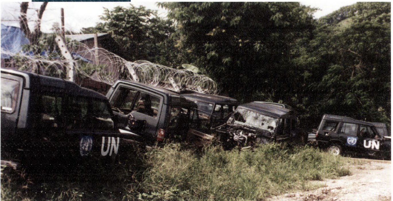
UN vehicles suffered in the violent aftermath of the East Timor independence elections.