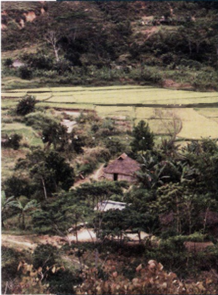
A village scene near the border town of Batugade