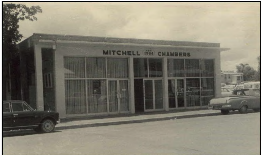
The Mitchell Chambers

Morgan and Buckley, which merged with long standing Alice Springs law firm Martin and Partners in 2004.