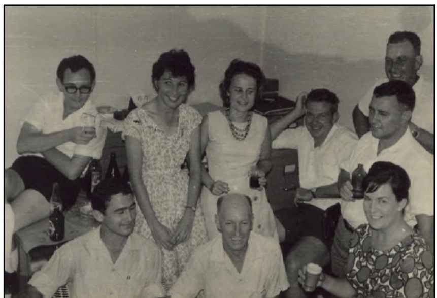
Below: A Cridland & Bauer office party.