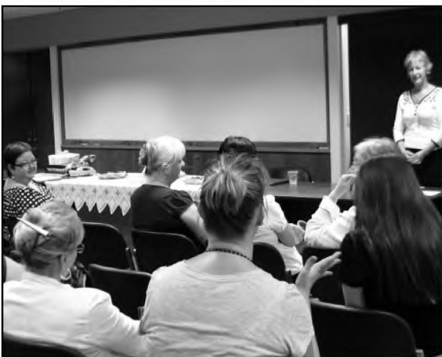
Above and right: The first NTWLA function for 2008