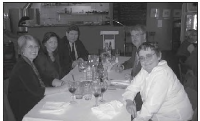
Local Court personnel meet Law Society and Law Council representatives