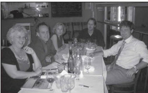
The team from CAALAS at the Alice Springs Law Week lunch

Alice Springs, Wednesday 30 May, The Lane Restaurant