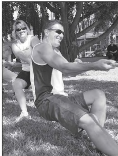
The Power and Water team, Power Play in action