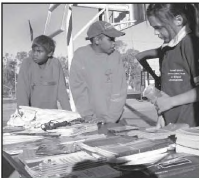
Young people at the launch