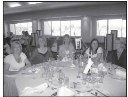
Members of the legal profession catch up at the Law Week lunch

Alice Springs, Wednesday 30 May, The Lane Restaurant