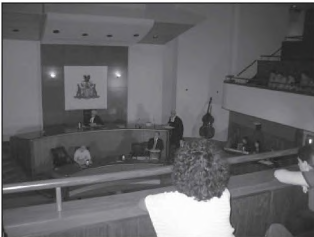
Audience members watch the second performance of Lethal Cross Examinations