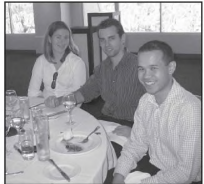
The team from Clayton Utz enjoy the lunch