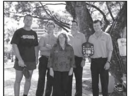
The Tug-of-Law champions for 2007, the Maley's Mudpigs.