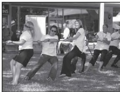
The Magnificent Media Team taking on the lawyers