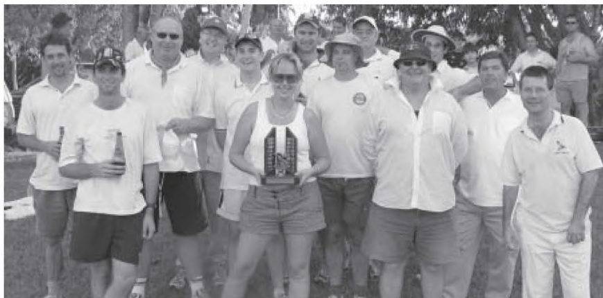
The Law Society President's XI team at the Marsh Law Week Cricket Challenge.