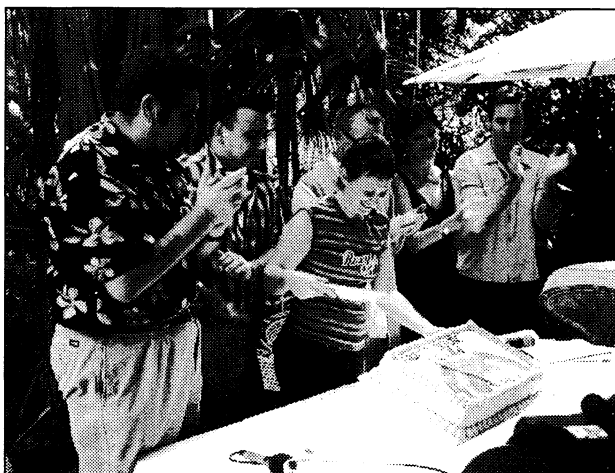
Above: It's a piece of cake – DCLS staff and supporters launch the submission at Twilight on Lindsay.