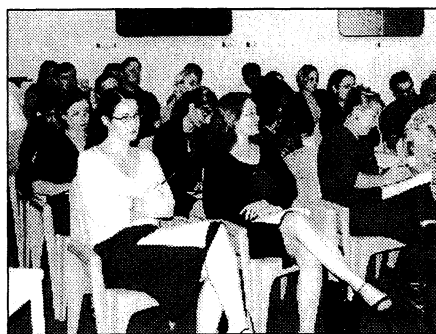
Above: A fascinated CLE group.