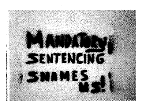
The writing is on the wall - 14 days jail for this illegal Act.

Great consternation occurred after television broadcasts of the media conference held by the Law Society, Bar Association and Criminal Law-