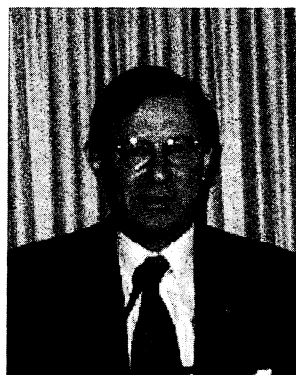
Federal Attorney General, Daryl Williams AM QC MP.