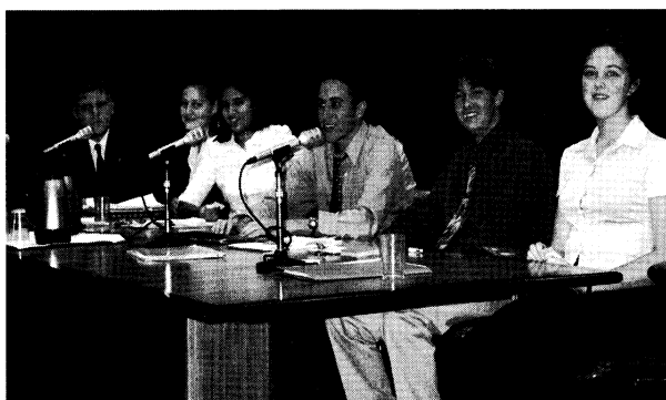
The 1999 Grand Final teams from Katherine and Alice Springs

win and back to compete in the preliminary rounds, finally triumphed, winning the competition between the northern and southern regions by six points.