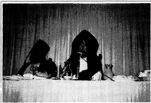
The 'Supreme(s)' Court

The Heart Foundation would like to thank them all very much.