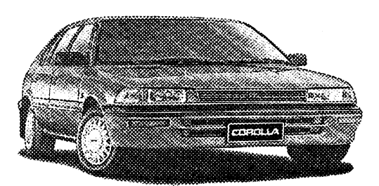
TOYOTA COROLLA. SUPERSEDED MODEL -$2,000 OFF! Members Only