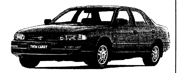
TOYOTA WIDE BODY CAMRY -$2,300 - $3,000 OFF! Members Only