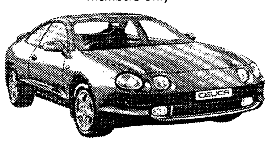
SENSATIONAL AND SAVAGE CELICA - $3,500 - $6,000 OFF! Members Only