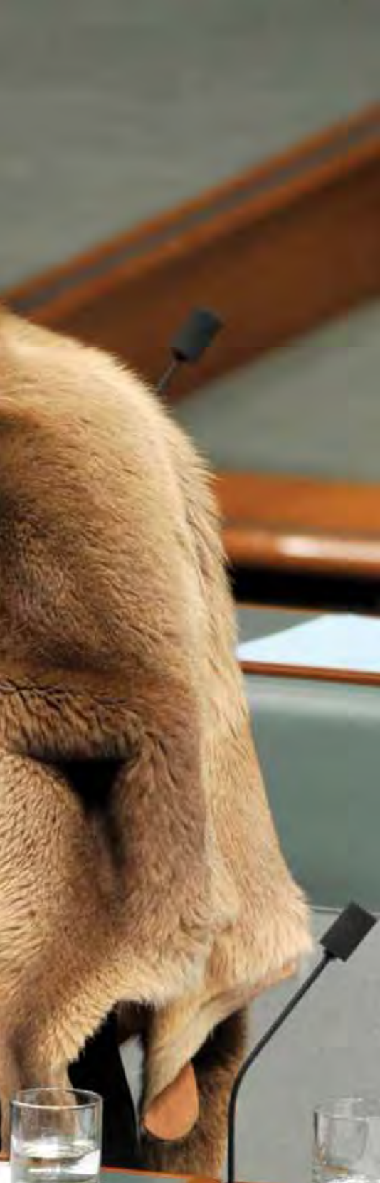
ROLE MODEL: Australia's first Indigenous member of the House of Representatives Ken Wyatt

“In order to be part of the process for consideration you’re going to have to make a concerted effort and join, because it’s only when you’re inside any political party that you have the opportunity of demonstrating that your skills are equal to anybody else’s.”